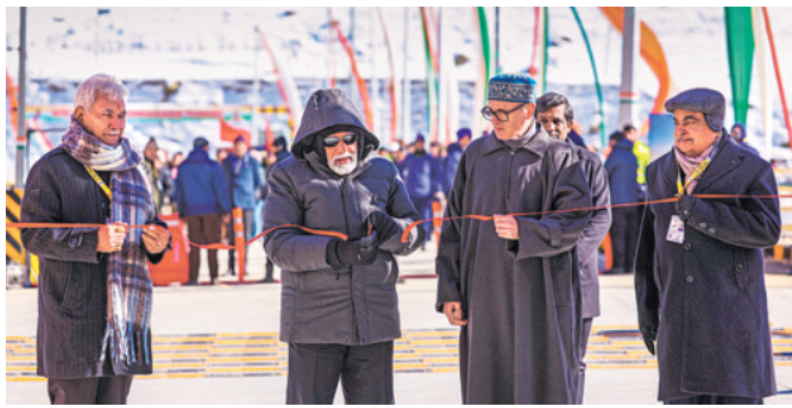
Prime Minister Narendra Modi flanked by J&K Lt Governor Manoj Sinha (left), Jammu & Kashmir Chief Minister Omar Abdullah (right), Union Minister Nitin Gadkari (far right), at the inauguration of the Z-Morh tunnel

Both PM Modi and Abdullah paid tributes to the seven workers who were killed in a terrorist attack near the tunnel site on October 20 last year. The PM said that the route between Srinagar and Leh would earlier be impacted by snowfall and ava-